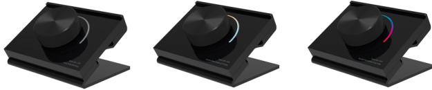
RK1 1 Zone Dimming

Rotary dimming/1-3 color/Wireless remote 30m distance/CR2032 battery